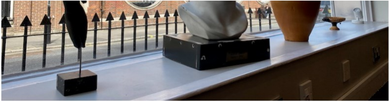
Inside the new classics centre at Francis Holland School

Francis Holland has established close ties with local St Marylebone Church of England School for Girls and teaches Latin classes for free to pupils in years 8, 9, 10 and 11.