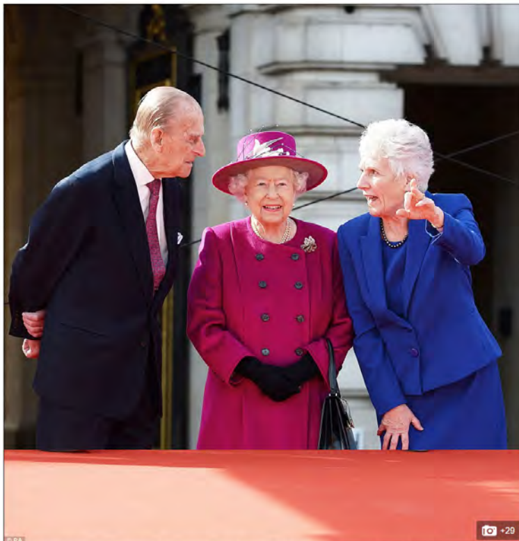
Earlier today, the monarch launched The Queen's Baton Relay for the XXI Commonwealth Games which is being held on the Gold Coast in 2018 at Buckingham Palace

Earlier today, she launched The Queen's Baton, a 368-day relay covering more than 140,000 miles and will visit every Commonwealth nation on its way to the Games, being hosted by the Australian Gold Coast in 2018.