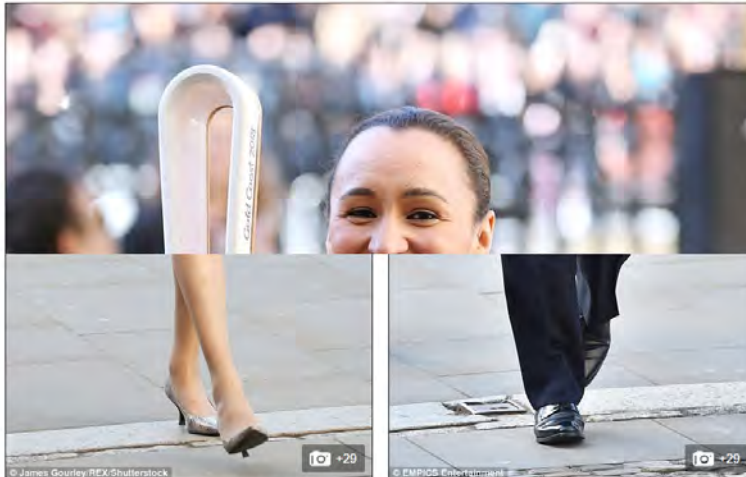
Prime Minister Theresa May was her usual stylish self, wearing snakeskin kitten heels and a printed dress to the annual service celebrating the Commonwealth (left). The service was also attended by former Prime Minister Sir John Major (right)