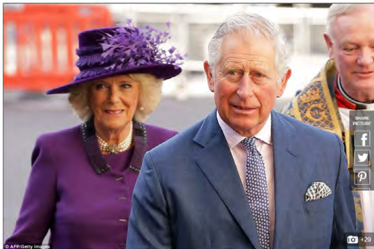
Prince Charles looked smart in a checked suit and spotted tie as he made his way to the service with his wife