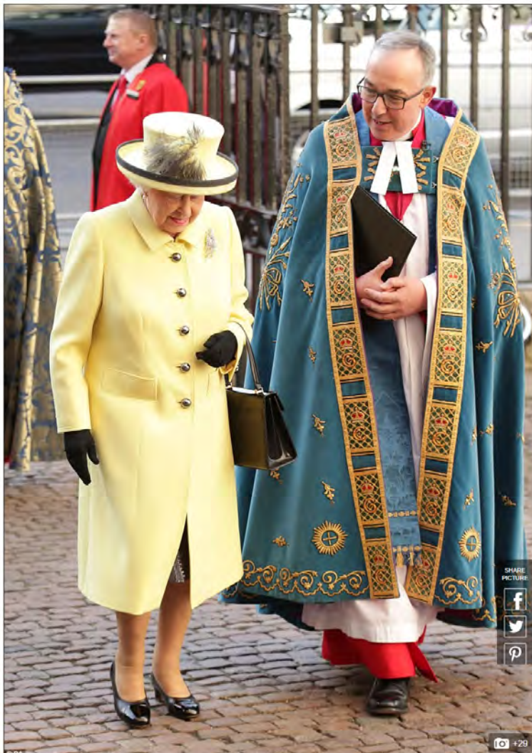
The Queen had managed to fit a quick outfit change in after hosting an engagement at Buckingham Palace this morning

Last year Sheeran supposedly suffered a severe facial injury at a party with Princess Beatrice after she apparently struck him in the face with a sword when she pretended to knight fellow pop star James Blunt.