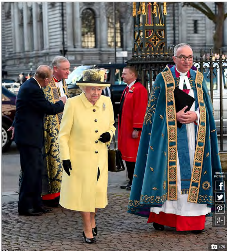
The Queen and Duke of Edinburgh arriving at the annual Commonwealth Day service and reception

'Working together, we build peace by defending the dignity of every individual and community.'