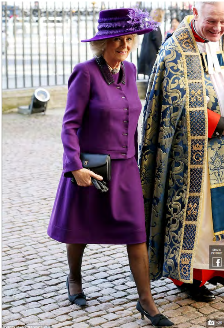
Tasking tips from the Queen? Camilla carried a clutch by Launer, the monarch's favourite handbag brand