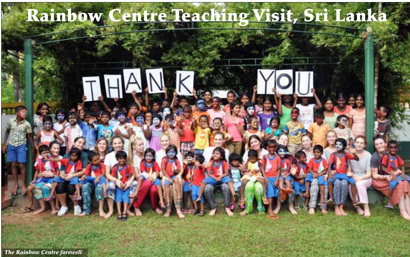
The Rainbow Centre farewell

Exceptional people do exceptional things, and the Sixth Form at Francis Holland fit squarely into this category. Thirteen students gave up a week of their October half term holiday to go to Sri Lanka to teach at the Rainbow Centre in Bentota. In the many months leading up to the trip, the girls completed a programme of work experience in local primary schools, fund-raised for the Centre, researched educational resources and created lesson plans to deliver to the Rainbow Centre.