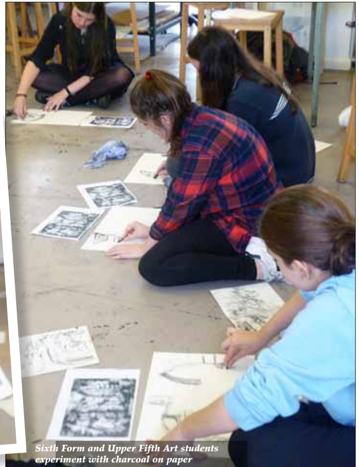
Sixth Form and Upper Fifth Art students experiment with charcoal on paper