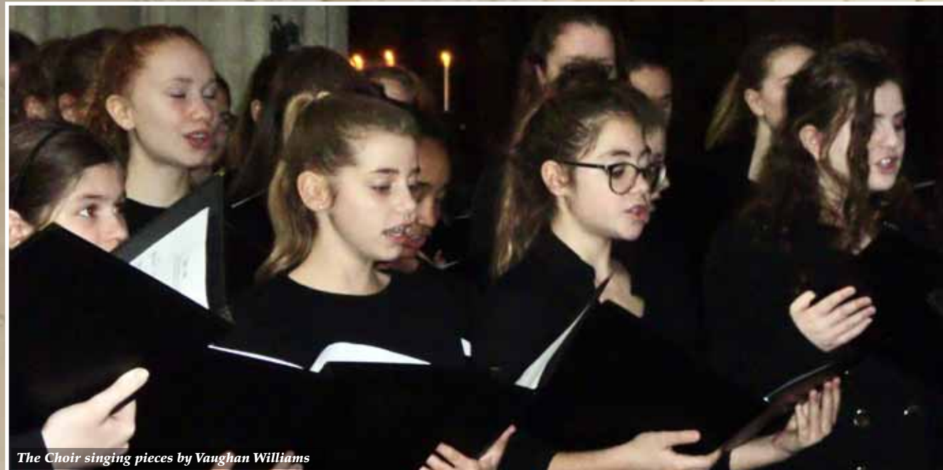
The Choir singing pieces by Vaughan Williams