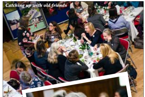
Catching up with old friends