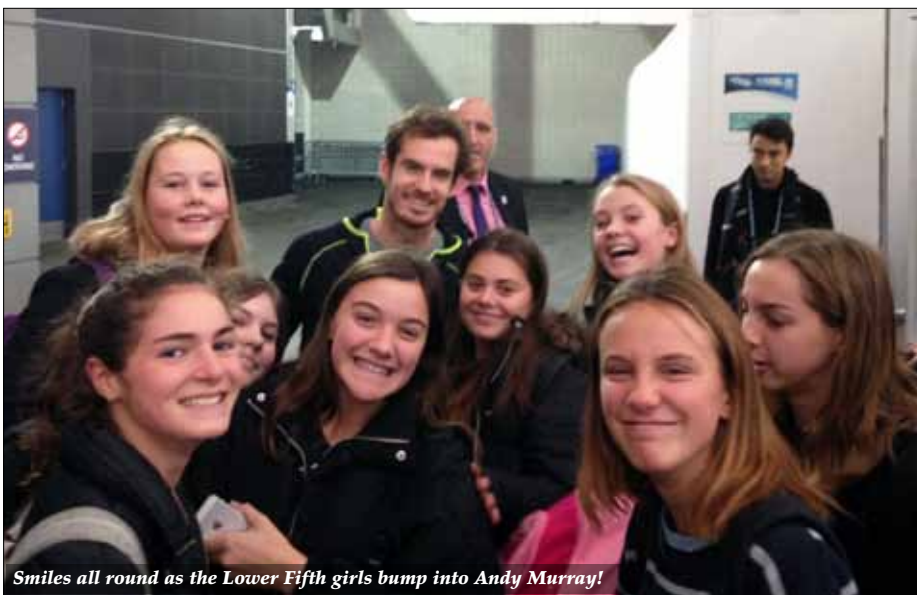
Smiles all round as the Lower Fifth girls bump into Andy Murray!