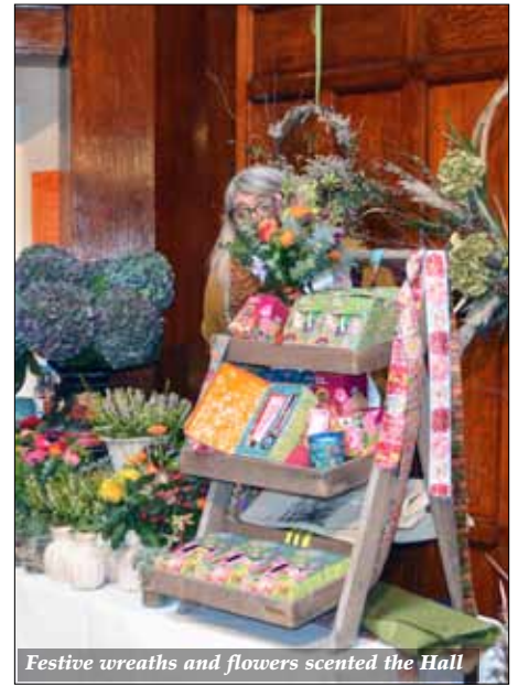
Festive wreaths and flowers scented the Hall