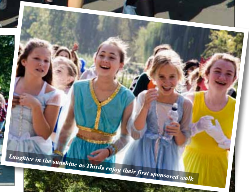
Laughter in the sunshine as Thirds enjoy their first sponsored walk