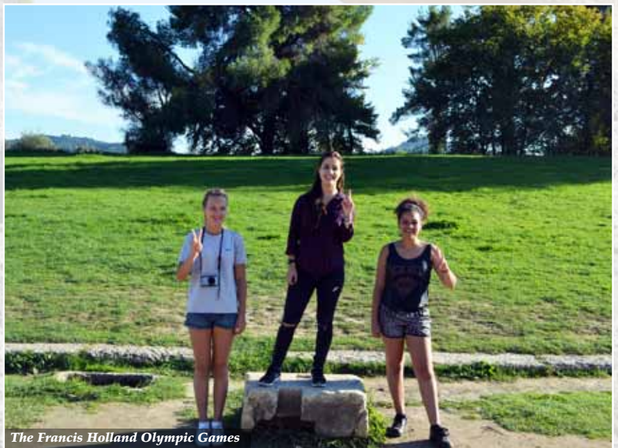
The Francis Holland Olympic Games