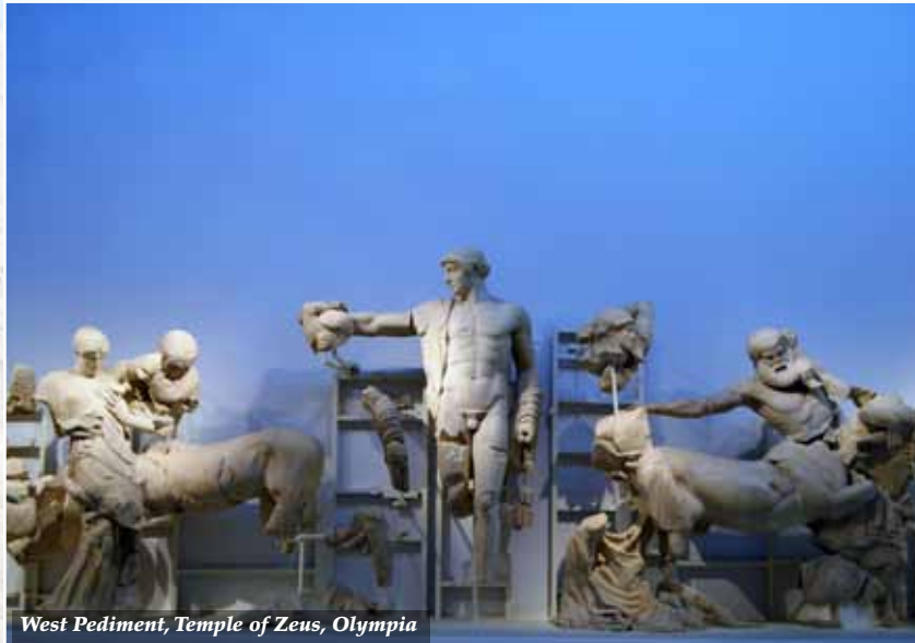
West Pediment, Temple of Zeus, Olympia

One of the most moving experiences of Olympia was viewing Praxiteles' 'Hermes with the baby Dionysus'. We all felt privileged to be in such close proximity to such a great work of art. Of course, the most momentous occasion of the day was the Francis Holland Olympic Foot Race in the ancient Olympic Stadium; heroes were born.