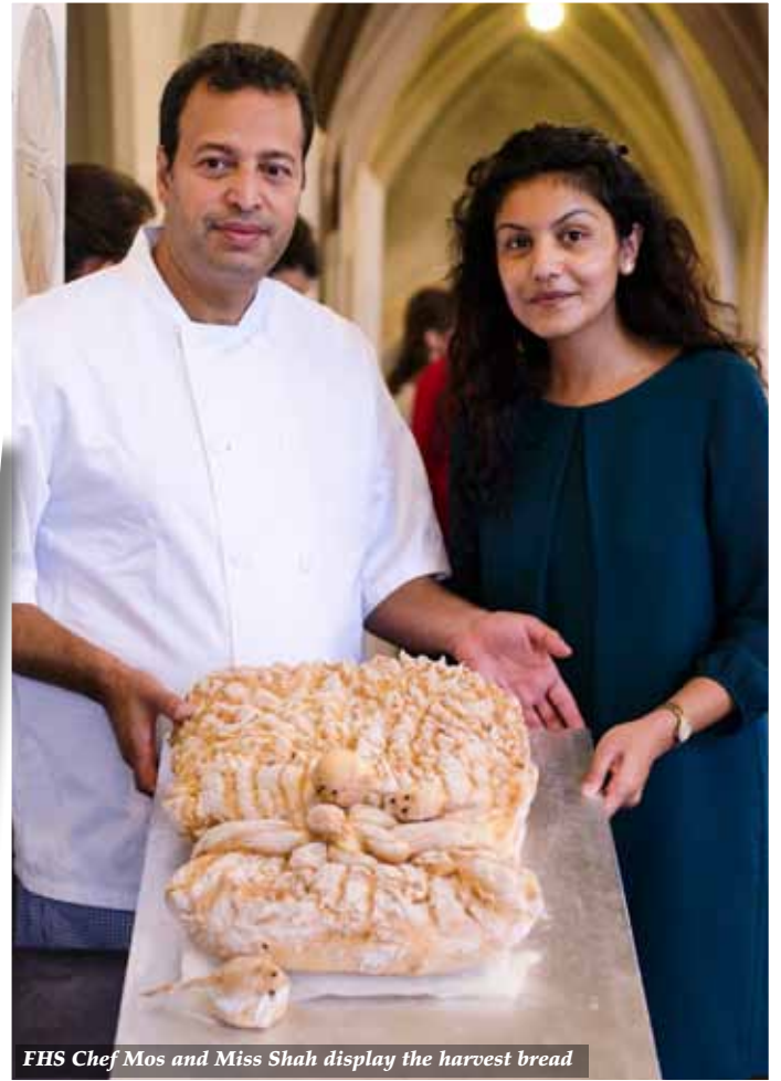
FHS Chef Mos and Miss Shah display the harvest bread