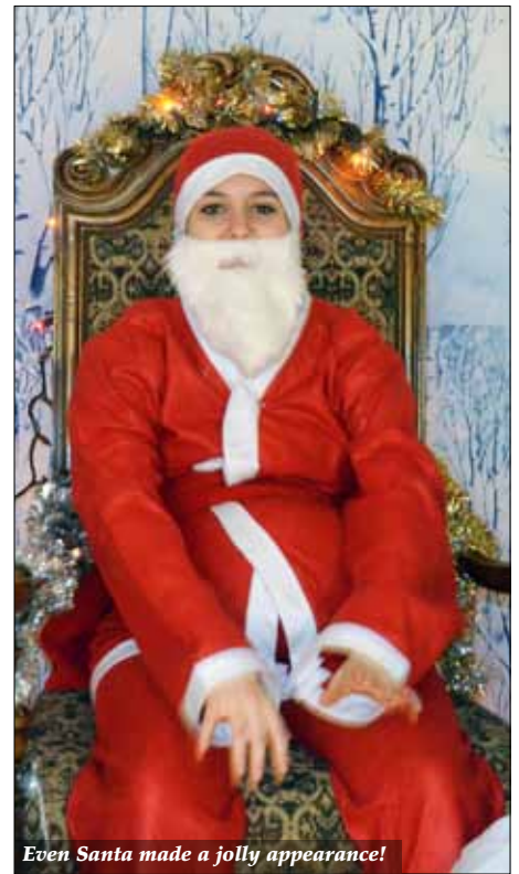
Even Santa made a jolly appearance!