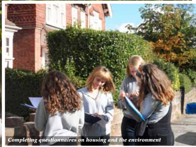
Completing questionnaires on housing and the environment