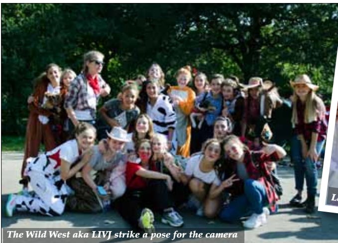
The Wild West aka LIVJ strike a pose for the camera