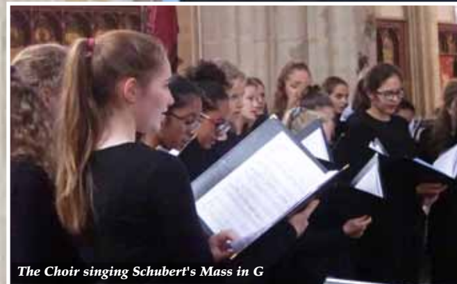
The Choir singing Schubert's Mass in G