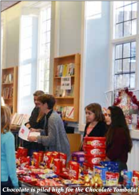
Chocolate is piled high for the Chocolate Tombola!

The minutes of early morning snow on Saturday brought with it extra Christmas spirit for the Fair. The school was filled all afternoon with plenty of shopping and Christmas activities.