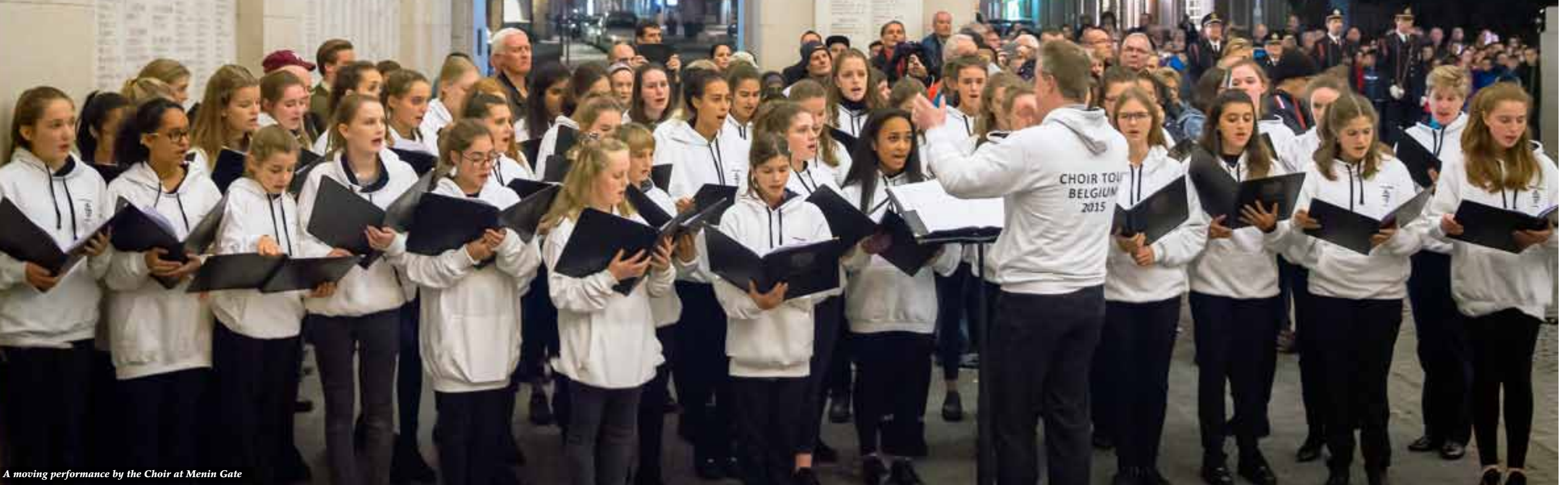
A moving performance by the Choir at Menin Gate