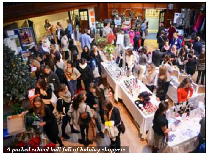
A packed school hall full of holiday shoppers