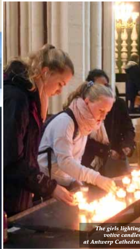
The girls lighting votive candles at Antwerp Cathedral