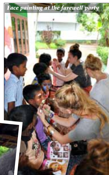
Face painting at the farewell party