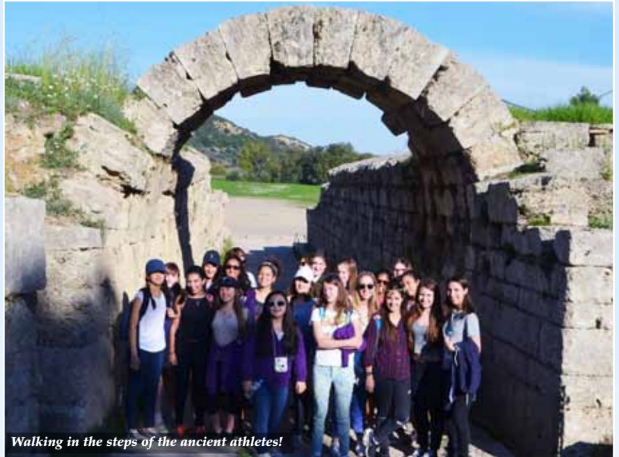
Walking in the steps of the ancient athletes!

The first stop was Athens. It is safe to say that you do not need to be a Classics enthusiast to be absolutely enthralled by a first sighting of the Acropolis looming over the city. Lit up at night, this is an unbeatable view. Nobody could wait to visit this magnificent sanctuary and so we got up early the next morning and made our way up the steep slope, taking in the Theatre of Dionysus on the way. Upon entering through the Propylaea, it was clear to the girls – and the teachers – why this ancient site draws in thousands of tourists a year. The students were lucky enough not only to wander around the immense Parthenon ruins, but also to be given a tour of the Acropolis Museum, which houses an impressive life-size sculptural reconstruction of the Parthenon.