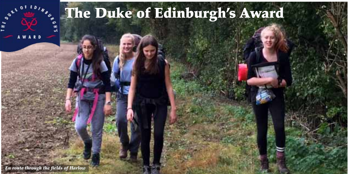
En route through the fields of Harlow

Congratulations to all the Bronze participants who have completed and passed their practice and assessment expedition weekends during the first half term. The girls should be proud of their efforts!