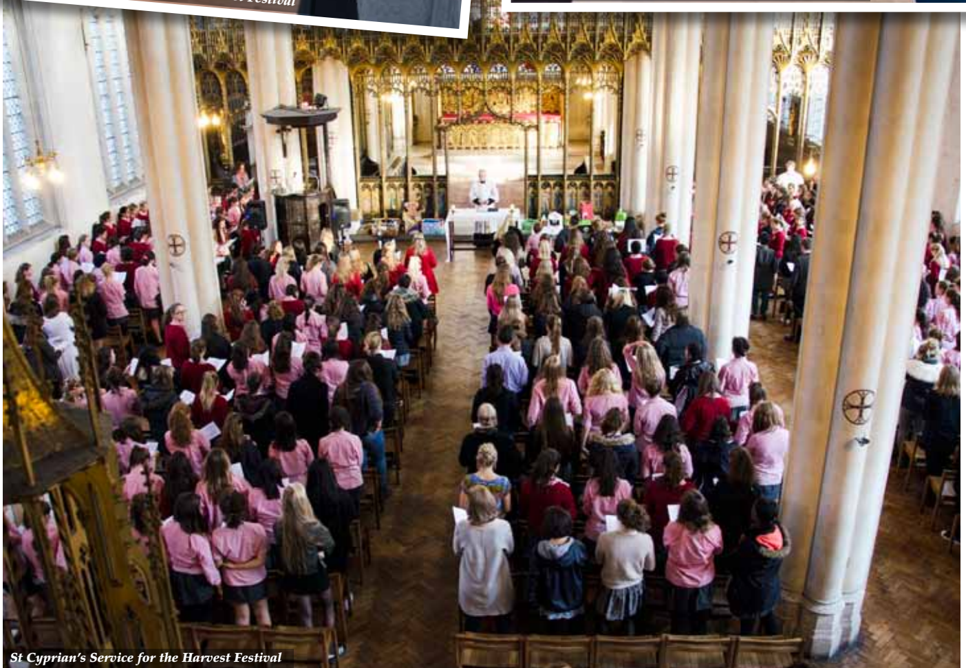
St Cyprian's Service for the Harvest Festival