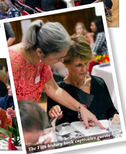
The FHS history book captivates guests