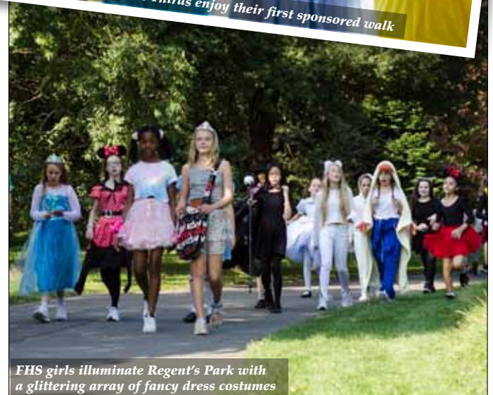
FHS girls illuminate Regent's Park with a glittering array of fancy dress costumes