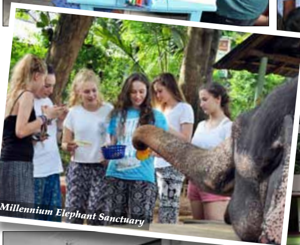
Millennium Elephant Sanctuary