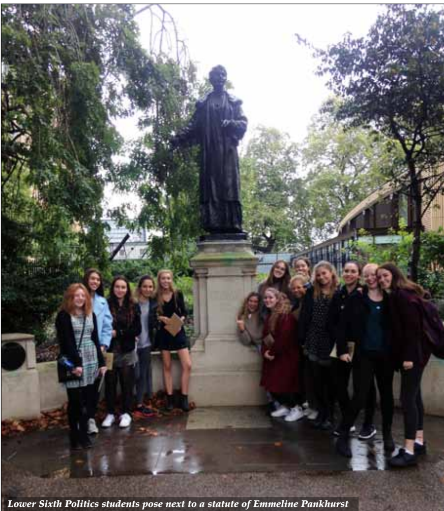
Lower Sixth Politics students pose next to a statue of Emmeline Pankhurst